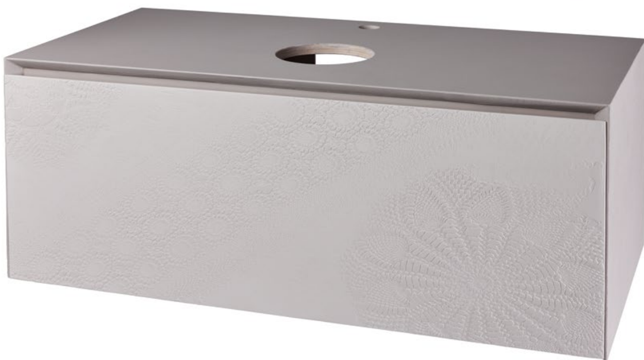
texture scocca / body